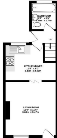
GROUND FLOOR 276 sq ft. (25.7 sq.m.) approx.